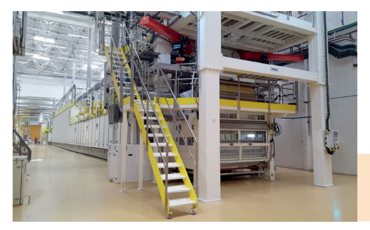
GPL 180 - 6,000 kg/h long goods pasta line, the most powerful line of the new generation ( Fava ).

(Fava - Via IV Novembre 29 - 44042 Cento - FE -Italy - Tel. +39 051 6843411 - Fax +39 051 6835740 - www.fava.it)