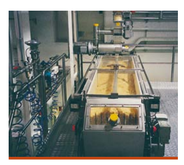
The stabilisation belt for pasta dough (Fava).

Fava has always distinguished itself for innovative solutions, with state-of-the-art