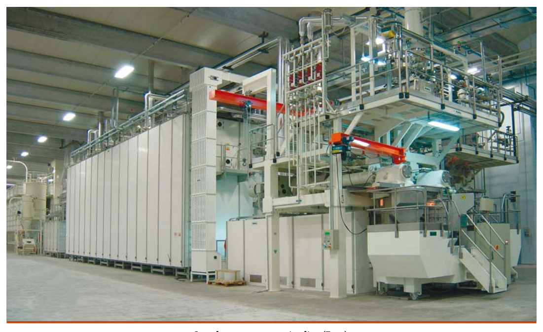
Complete pasta processing line (Fava).

been characterized by other innovations and improvements in both the production and drying processes. After an initial period of continuous improvements, the presses are now equipped with a stabilisation belt for dough that has assumed its final characteristics. granting a great ease of handling and, above all, a finished product which is much lighter in colour and much more transparent than that obtained by traditional methods. The negligible energy required for the belt and the ease in cleaning complete the picture, helping to explain the reasons of its success. In addition, the press has been equipped with